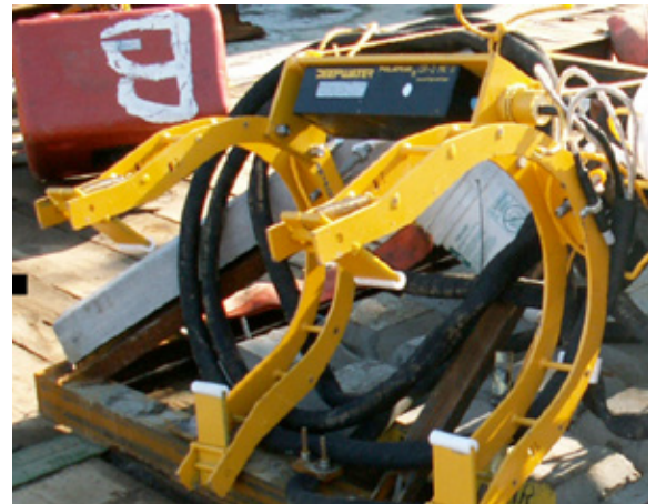
RETROFITS DR-2 to be retrofitted to a subsea pipeline attached to two RetroClamps.