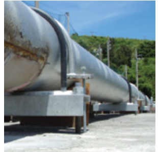
Well-supported pipes are no problem.

A: No, not if the piping is correctly supported along its length. If there is noticeable sagging between support points, then the pipe is being overstressed and is inadequately supported. Note: I-Rod has been used on hundreds of thousands of pipe supports for over 25 years, and we have never seen a problem.