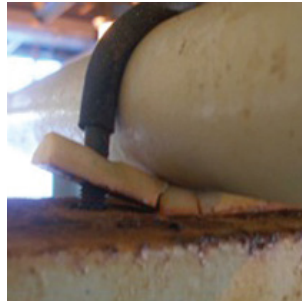
Failed I-Rod imposter

A: No. I-Rod is a high-impact thermoplastic material. Teflon and Delrin are commonly used to try to copy I-Rod, but both fail, causing dangerous pipe corrosion. Teflon is not suitable because it lacks sufficient compressive strength.