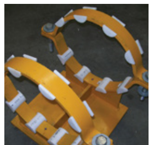
I-Clips on a Grinnell pipe clamp

A: I-Rod Clips are used to line saddle-clamp-style supports and Grinnell clamps. Made of the same thermoplastic material (I-Rod), they are designed to prevent crevice corrosion at more substantial weight-bearing supports. They are available in sizes to fit standard Grinnell clamps and pipe cradles, and can also be custom-sized or pre-installed in Grinnell clamps.