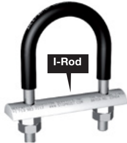
I-Rod is part of a Nu-Bolt

A: I-Rod thermoplastic is the white, half-round rod we use for all types of pipe supports, and that’s why we call the brand I-Rod. A Nu-Bolt assembly is simply one form of an I-Rod pipe support. The Nu-Bolt is one piece of I-Rod fitted on a coated U-bolt with 4 nuts. Download the I-Rod Catalog.