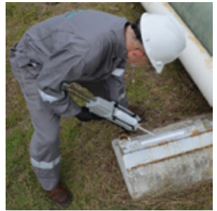
I-Rod Adhesive permanently bonds.

A: I-Rod Adhesive is designed to securely anchor strips of I-Rod in situations where drilling and bolting would be difficult. It provides a permanent bond to concrete or steel surfaces.