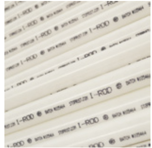
Authentic I-Rod is distinctly marked.

A: Every shipment of I-Rod is traceable, and is sent with a certificate of authenticity. All I-Rod is distinctly marked.