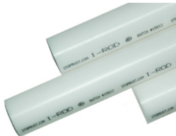
MADE FROM EXTREMELY DURABLE THERMOPLASTIC MATERIAL High-temperature options available up to 249C°.