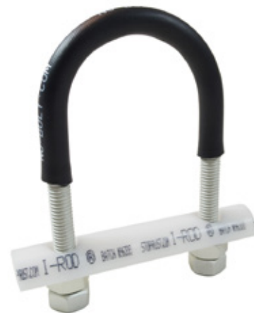
NU-BOLT ASSEMBLY IS THE MOST POPULAR INSTALLATION CHOICE I-Rod Adhesive can be used when bolting is not possible.