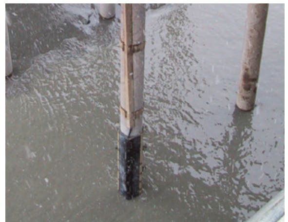
RAPAROUND IN SITU After two brutal Alaska winter freezes, performance is unaffected.