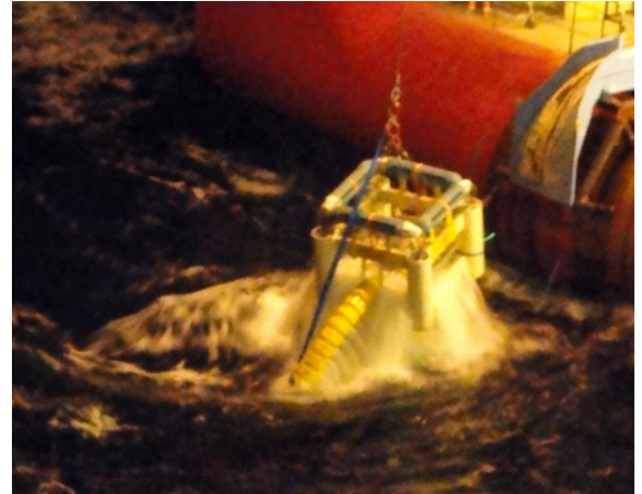
RETROBUOY RetroBuoy during deployment in the North Sea.