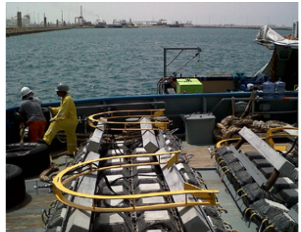
A SPECIAL DESIGN FOR QATAR

The wire rope core of the mat provides a low resistance anode array.