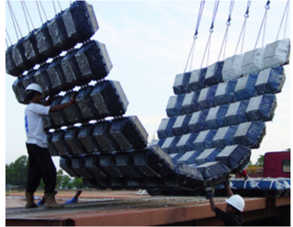
ANODES ARE CAST INTO THE CONCRETE SEGMENTS

The wire rope core of the mat provides a low resistance anode array.