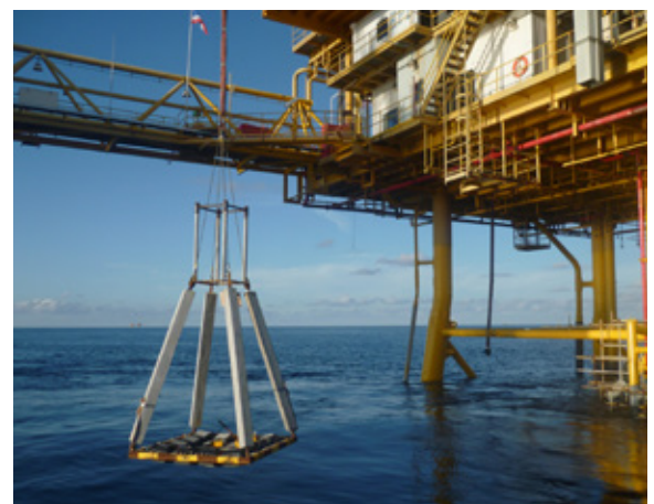
VERY COST-EFFECTIVE RetroPod installation time is only one-fourth that of traditional anode retrofits.