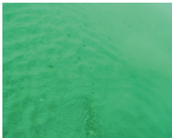
NINE MONTHS LATER VSE anode completely buried after 9 months, photographed on a service visit