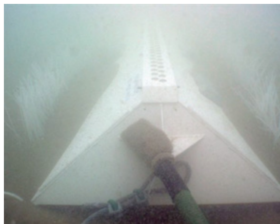
INSTALLATION VSE anode installed on bottom: it is already beginning to silt over