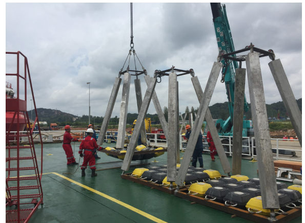
RETROPODS LOADED ONTO VESSEL