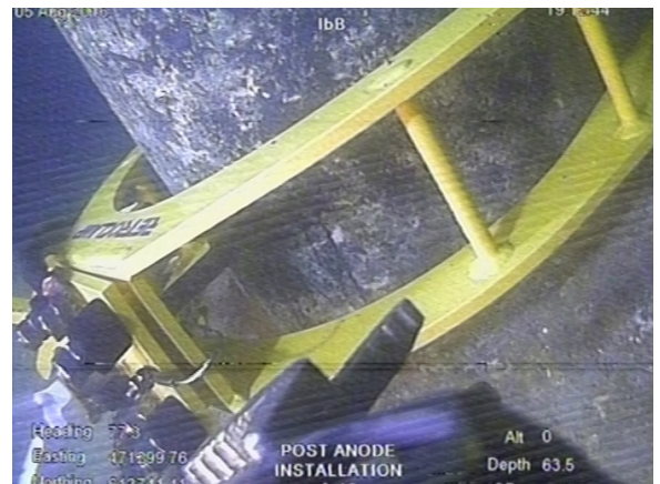
RETROCLAMP INSTALLED ON MEMBER