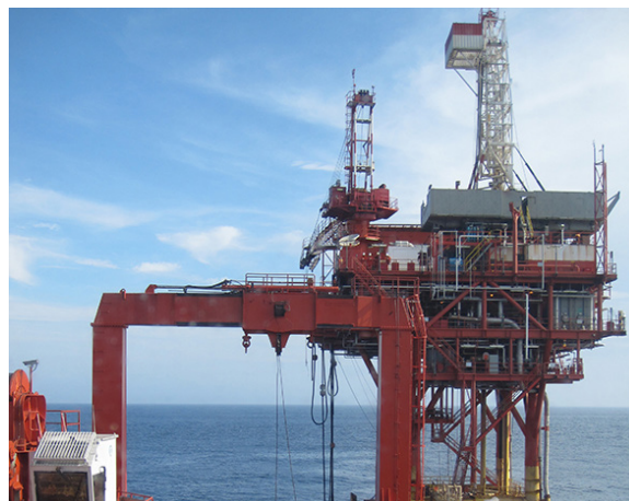
LUFENG (LF) 13-2 WHP

The CNOOC platform is located in the South China Sea in 430 ft. of water.