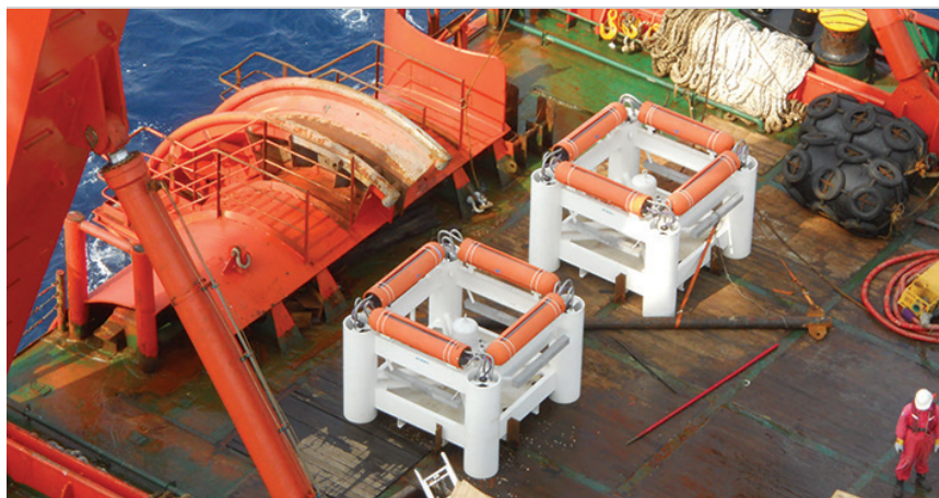
PREPPED FOR TERMINATION

The RetroBuoy™ replaced a failing galvanic CP system.