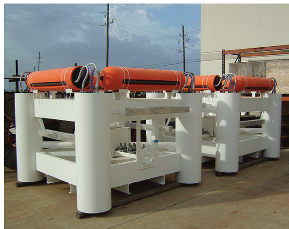
BRING IN THE BUOYS

The CNOOC platform is located in the South China Sea in 430 ft. of water.