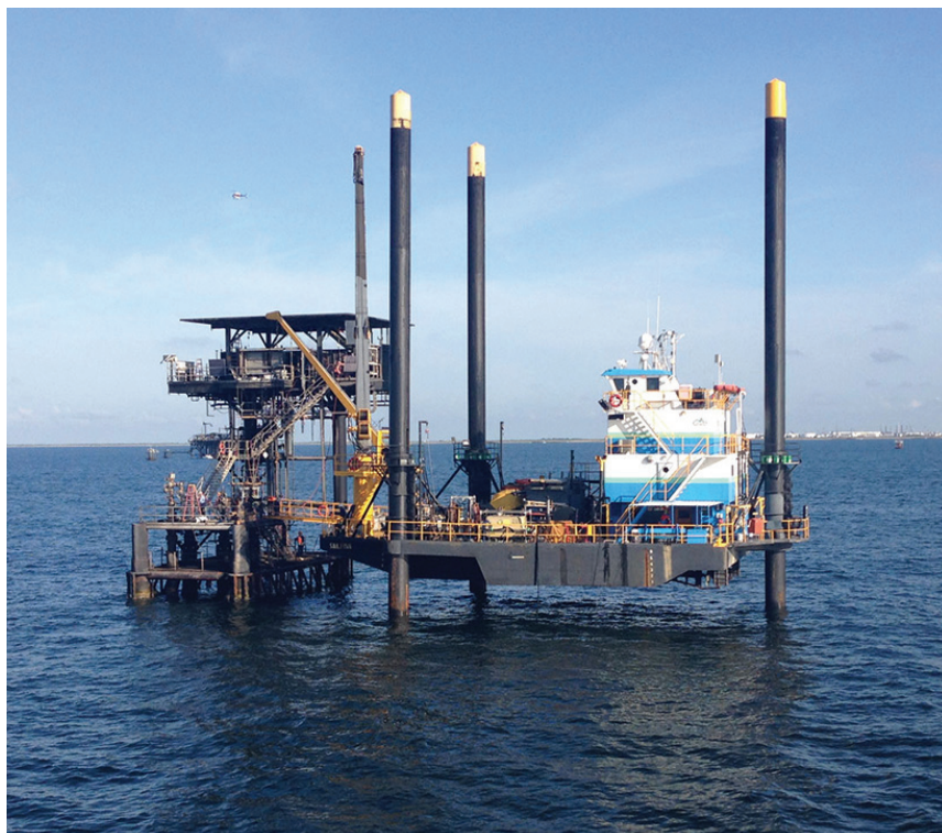
THE SITE A jack-up rig was used for installation rather than a work boat.