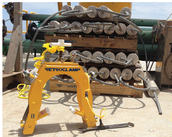
THE HARDWARE A RetroClamp™ sits next to soon-to-be-deployed RetroLinks™.