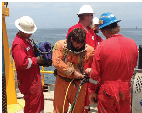
THE TECHNICIANS Installation technicians help a diver who will assist with anode placement.