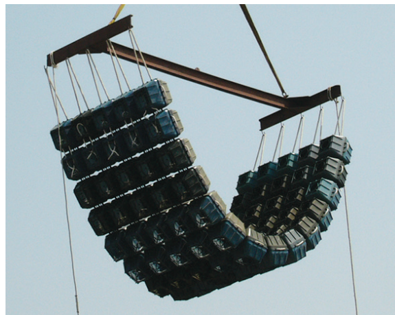
ANODES ARE CAST INTO THE CONCRETE SEGMENTS The wire rope core of the mat provides a low-resistance anode array.