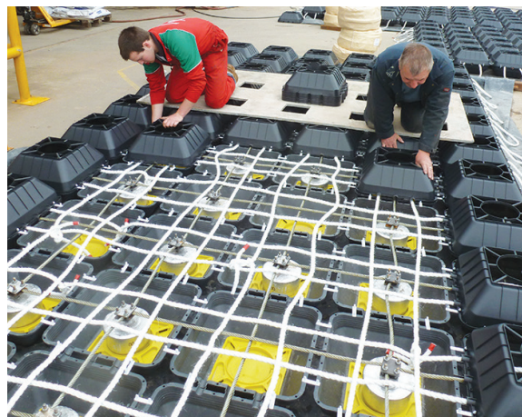
SHIPPED AS ANODES AND EMPTY SHELLS Local crews clip the mats together and fill them with concrete on-site.