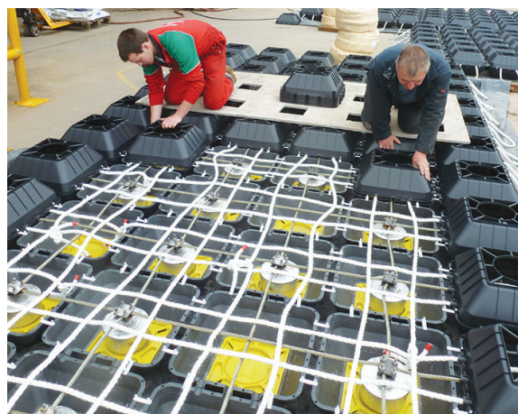
SHIPPED AS ANODES AND EMPTY SHELLS Local crews clip the mats together and fill them with concrete on-site.