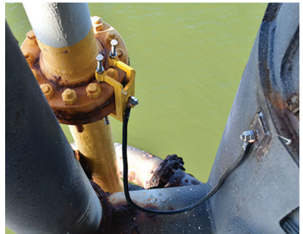
VAMP CLAMP™ WITH BONDING CABLE

The clamp was installed to ensure electrical continuity across the flange.